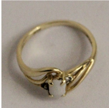
Best Gold w/Stone Opal Ring Kevin Bean