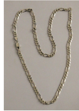
Best Silver Necklace Cheryl Petenbrink