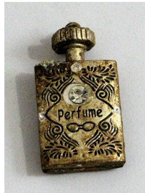
Most Unusual Perfume Necklace Charm Cheryl Petenbrink